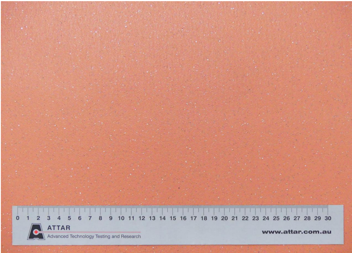
Figure 1: Tarasafe Standard